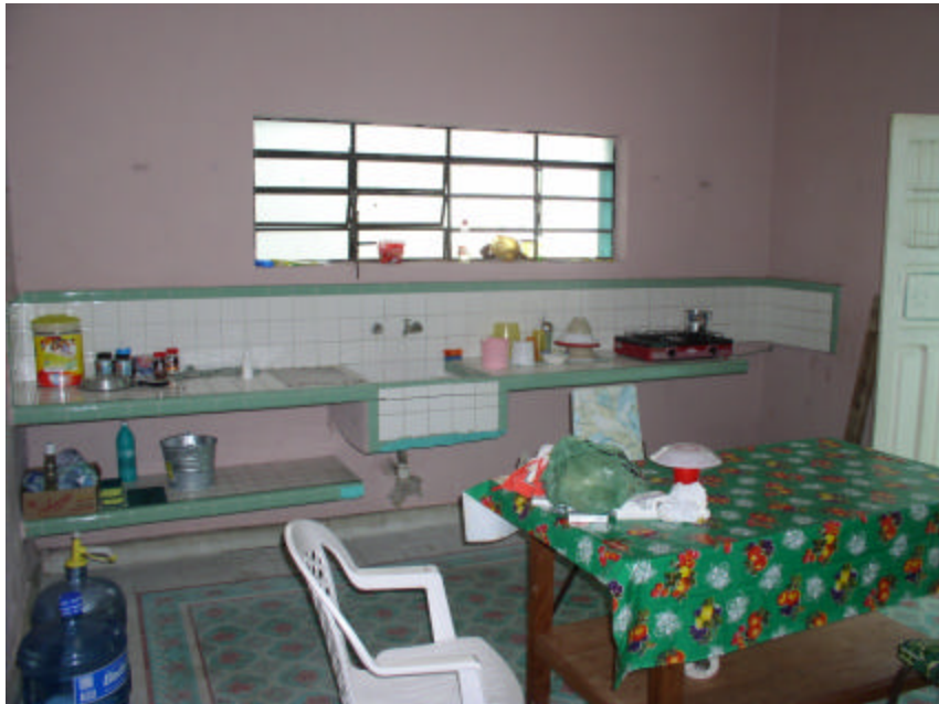
Kitchen and original door to patio