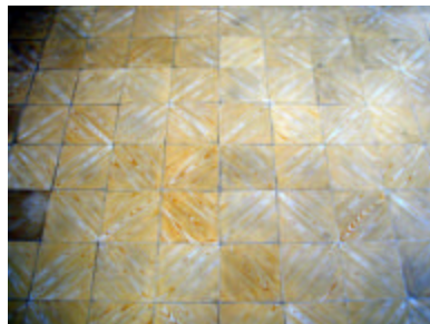
Floor tile in rear bedroom