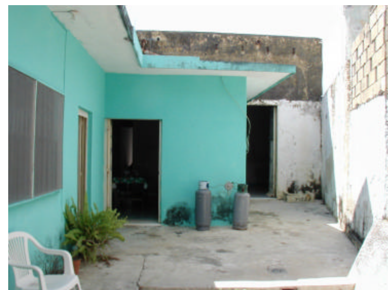
Dining & porch areas.