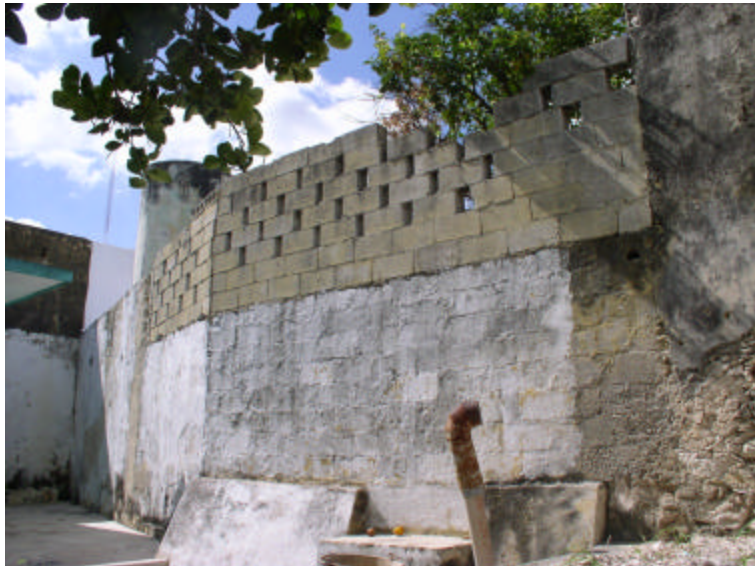
The wall – future site of raised garden bed