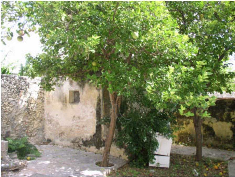
Rear bathroom - site of future stairs & outdoor shower