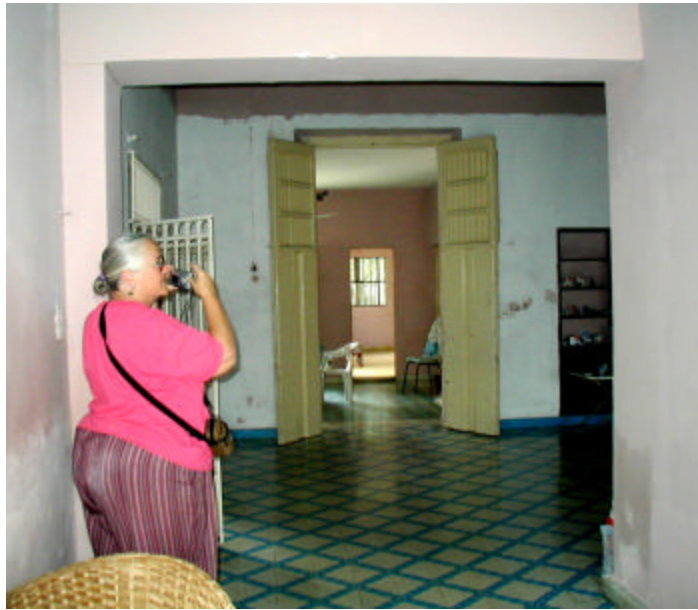
Entering the living room