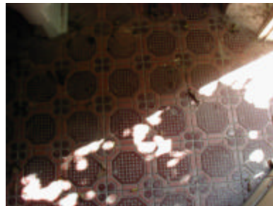
Floor tile in rear bathroom