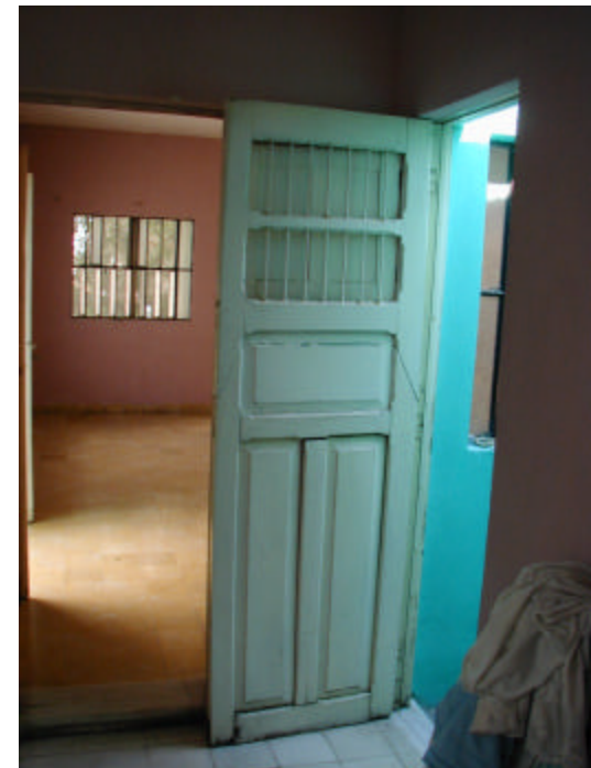
Kitchen door to air shaft & view to rear bedroom