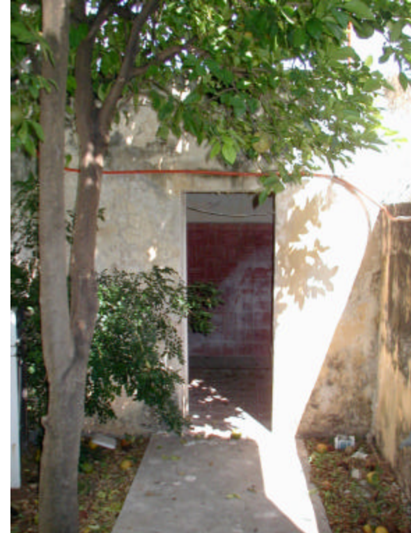
Path from rear bedroom to rear bathroom