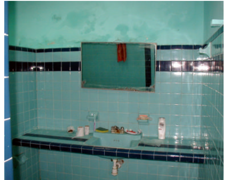
Main bathroom, with shower before it was expanded to include the air shaft