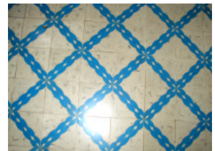
Floor tile in entry, lr & front br