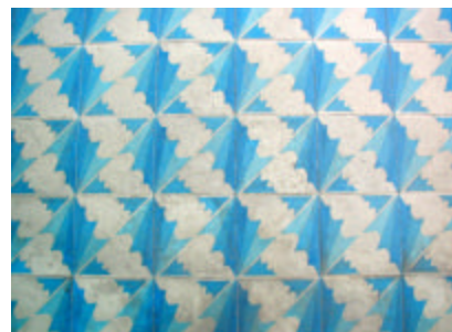
Floor tile in front room