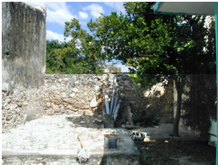
Pool site from dining area