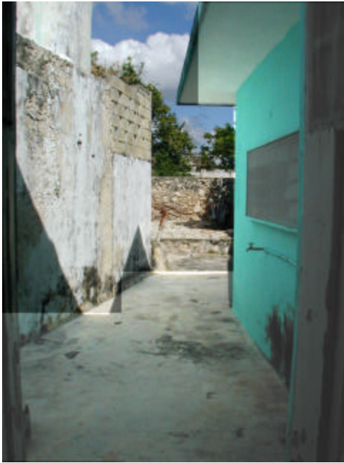
Porch & yard from front bedroom