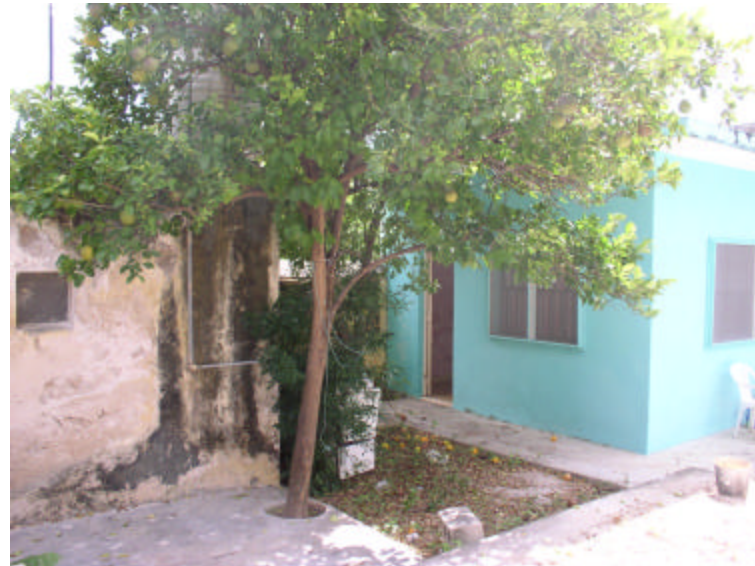
Original door to rear bedroom