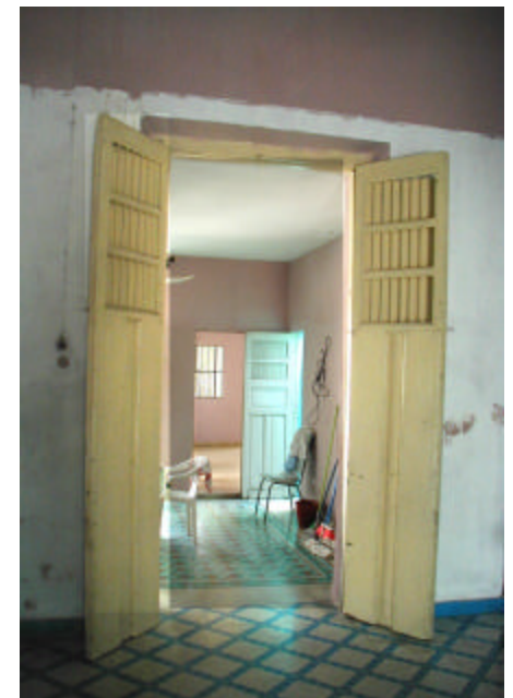
Doors from lr to kitchen & beyond