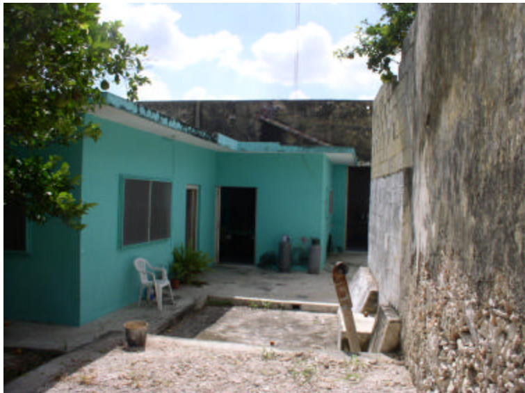
Garden & dining areas from pool site