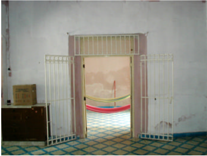
Front bedroom (from living room)