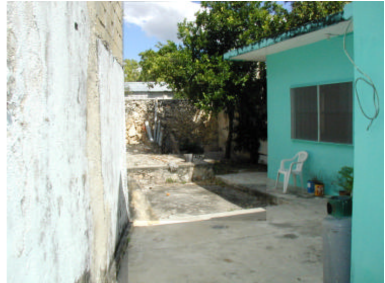
Dining & garden areas from porch